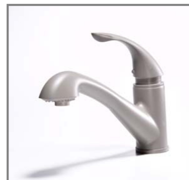
3. Metalizing the Objet model with a conductive surface