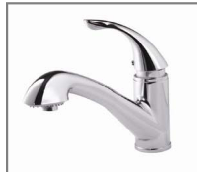
5. Final metal coating by nickel