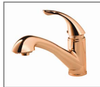
4. First coating of model with copper

Automotive, appliance, military, marine, trucking, electrical and construction are some of the markets in which metal coating is found. Metal coating can be applied to parts such as fasteners, brackets, clips, clamps, stampings, beams and rotors.