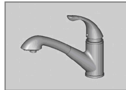
1. Faucet model design by CAD

The plating bath is the final bath of the preplate cycle. A thin deposit of metallic file is deposited on the Objet part. It can be made of nickel or copper depending on the objects application. Electroless plating helps electroplated parts in a corrosive environment.