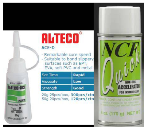
Figure 3. Recommended glue types