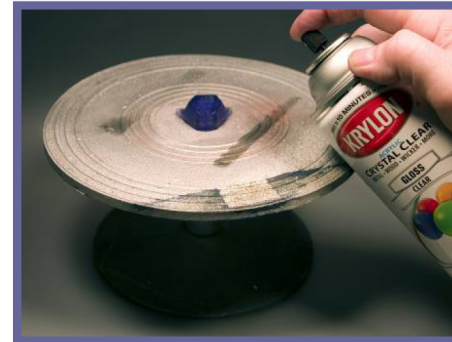
3a. Spray part with a clear coat finish.