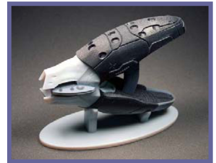
Printed Connex™ needler