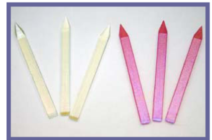
Clear needles printed in FullCure®720 (left) and dyed version (right).