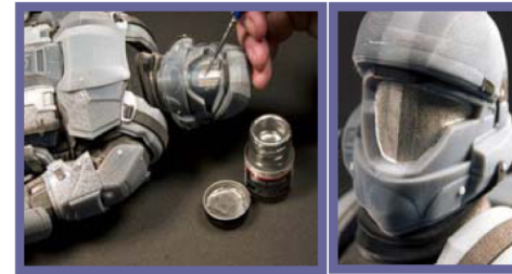
4. Paint face bright metallic silver.