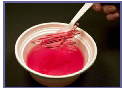
2. Soak parts in water and dye solution for approximately 15 minutes.