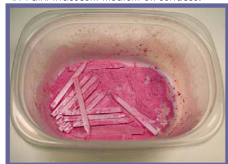
4. Dust parts in a container with powdered pigment.