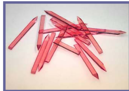
Detail of dyed and dried needles