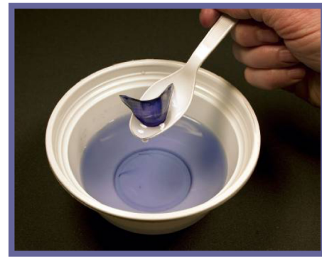
2a. Remove from dye solution after approximately 15 minutes.