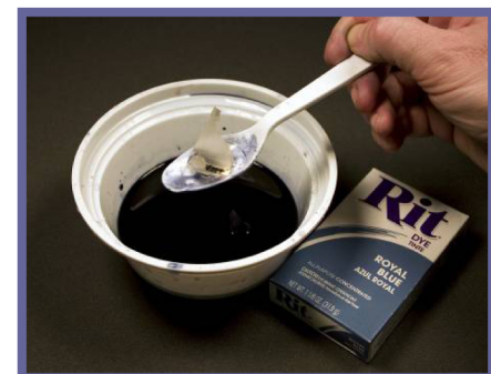
2. Soak part in warm water and powdered dye solution.