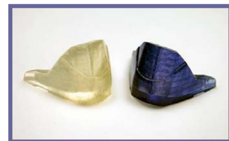
Clear lens visor printed in FullCure®720 (left) and dyed version (right).

After the cleaning and drying process is complete, applying dye is as simple as mixing common clothing dye in water and soaking the part in the solution. In this example, the lens was placed in warm water mixed with royal blue dye for 10 to 20 minutes.