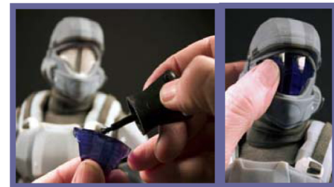
4a. Apply glue to dyed lens and press in place.